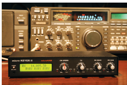
The MicroHam Keyer Mk II controlling the author's TS-940